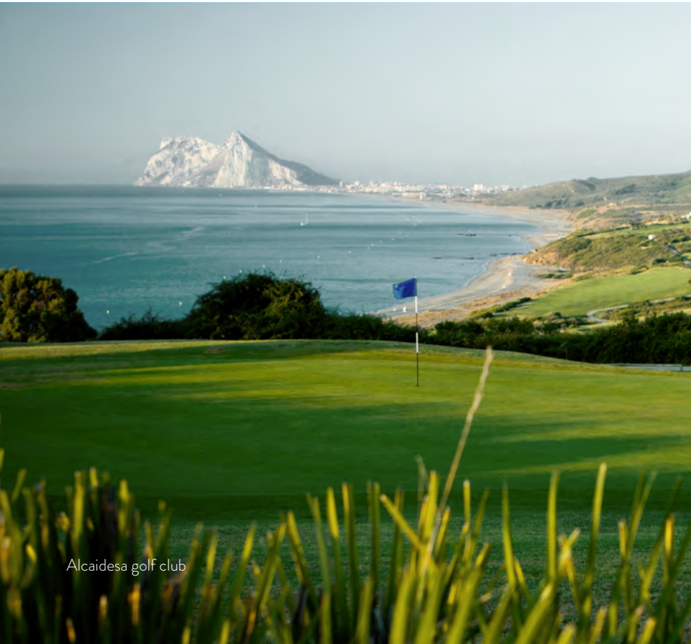
Alcaidesa golf club