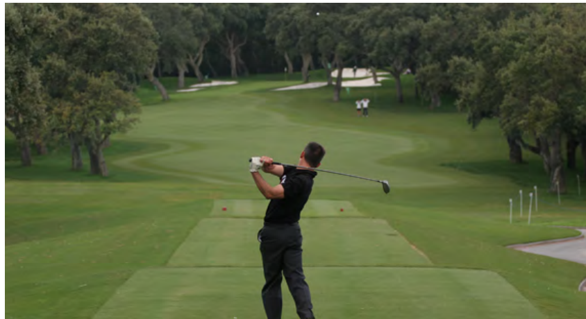
Real club de golf Valderrama