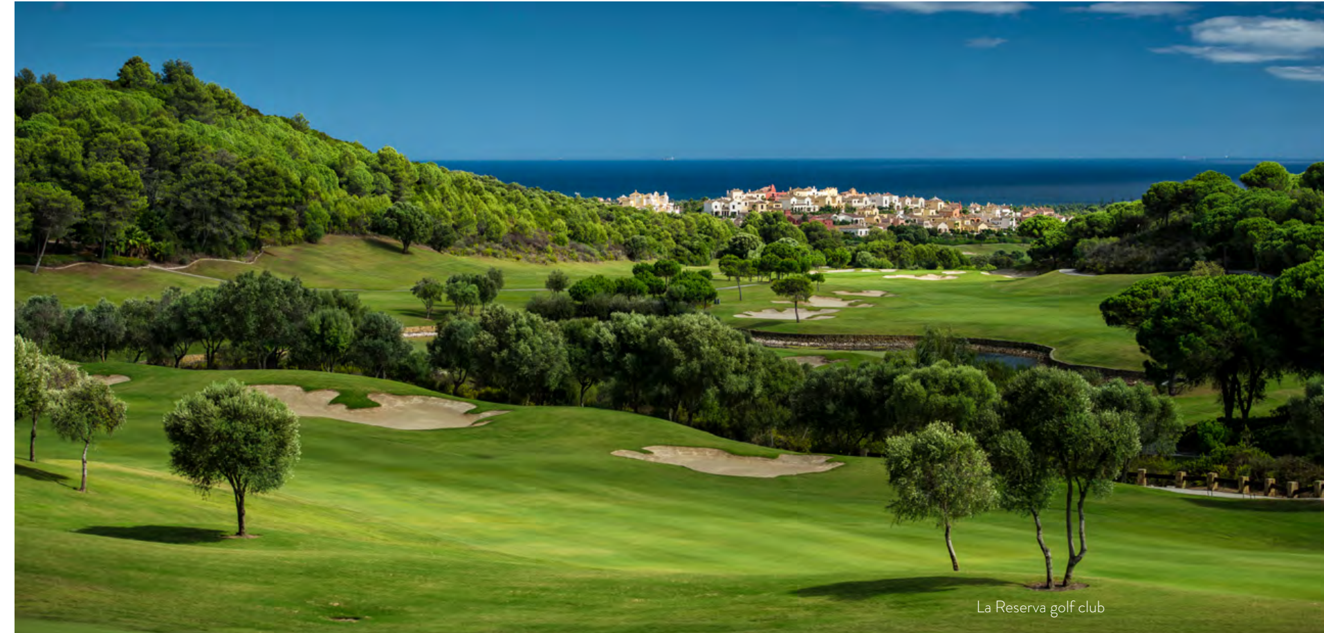
La Reserva golf club