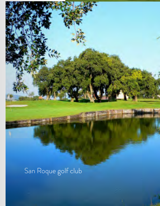
San Roque golf club

La Reserva Club in Sotogrande is just 5 minutes away and has many facilities on offer including the Golf Course, Horse Riding and the original 'The Beach', a fantastic resort beside the Golf Course which includes a restaurant, white sandy beach and lagoon for sports activities etc.