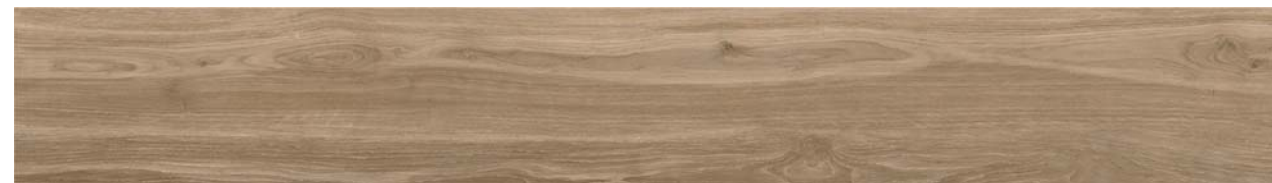
Origin Umber 22,5 x 180 cm

In the main bathroom, a box is designed for the shower and bathtub area, fully tiled and with a great visual effect, with large-format rectified porcelain tiles with a travertine-effect finish.