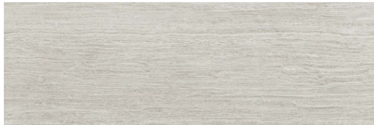
Travertino Grey 100x300 cm

In the main bathroom, a box is designed for the shower and bathtub area, fully tiled and with a great visual effect, with large-format rectified porcelain tiles with a travertine-effect finish.