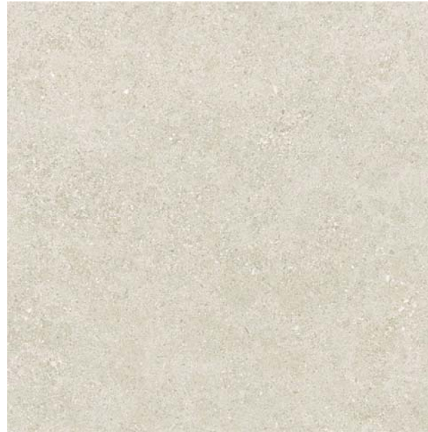
Roadstone Linen 90x90 cm

On main and secondary bedrooms Wood looking rectified porcelain Origin Umber, 22,5 x 180 cm as per below image.